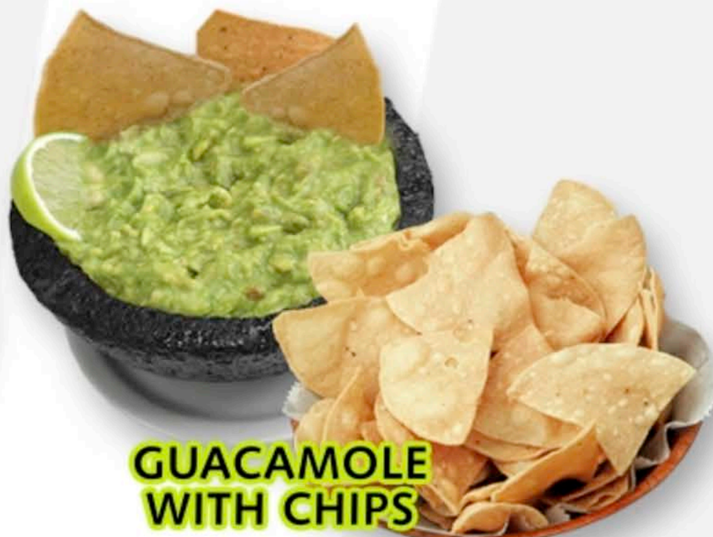
GUACAMOLE WITH CHIPS