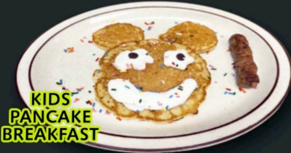
KIDS PANCAKE BREAKFAST

MARCELAS COMBO $13.99 Tamale, 2 pancakes, 2 eggs, 2 bacon or sausage link.